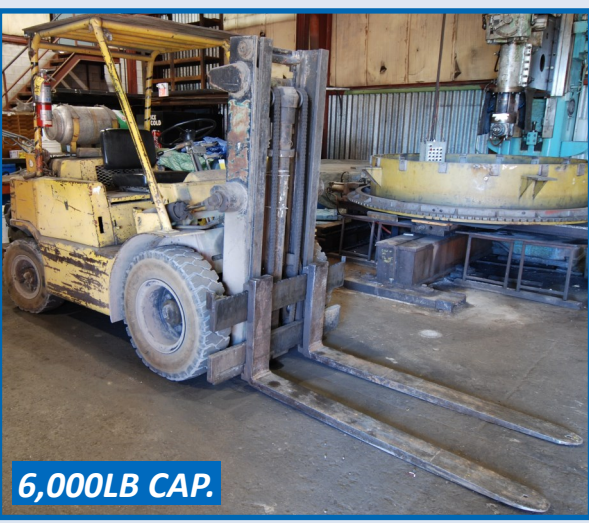
CLARK CY10C FORKLIFT