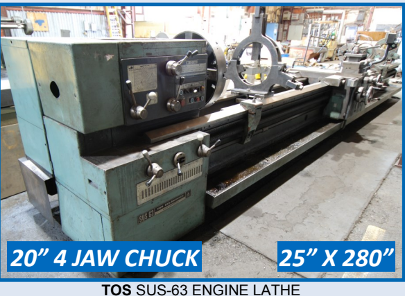
16" X 48"