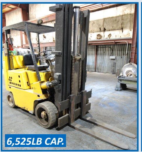
CLARK C500-S80-QLP FORKLIFT