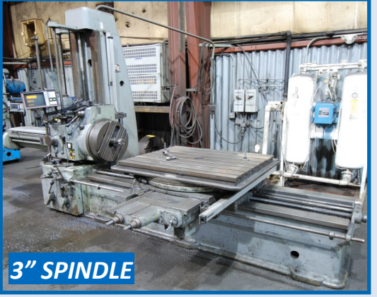
DABROWSKA HWC-110 HORIZONTAL BORING MILL