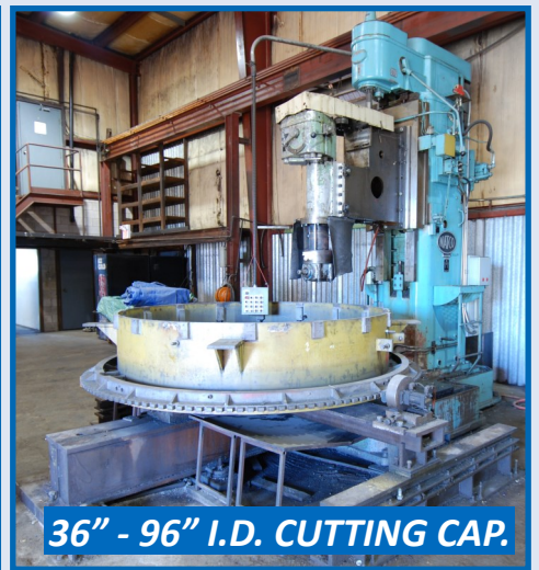
NATCO CUSTOM INTERNAL GEAR CUTTER