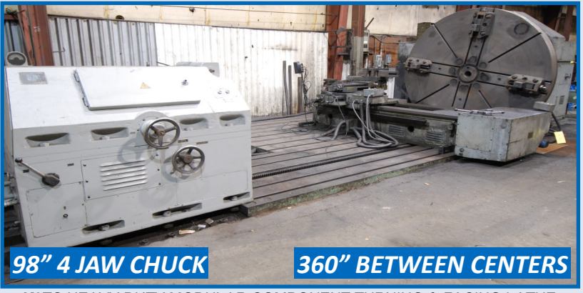
15HP MILLING HEAD 242" X 66" TABLE