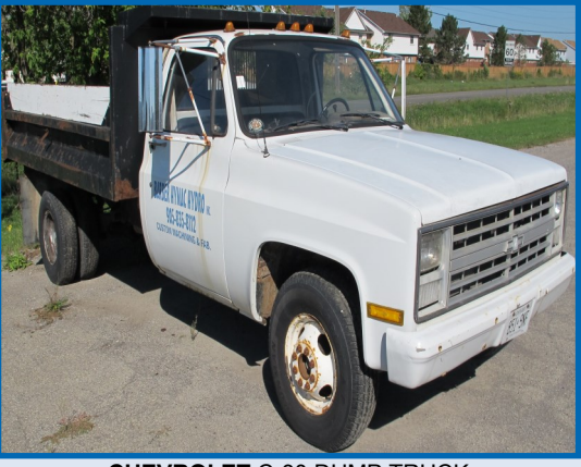
CHEVROLET C-30 DUMP TRUCK