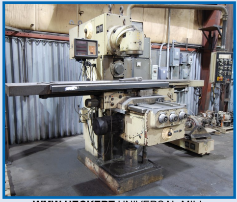
WMW HECKERT UNIVERSAL MILL