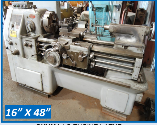
OKUMA LS ENGINE LATHE