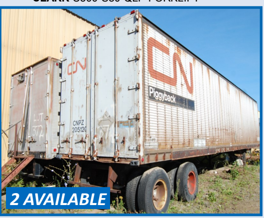
DUAL AXLE TRAILERS