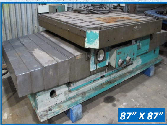
TOS CNC IN-FEEDING POWER ROTARY TABLE

Boring Mill, 3-Axis DRO, 4.33" Spindle, 55" x 47" Table, Travels: X-72", Y-48", Z-48", 36" Spindle Travel, Speeds to 562 RPM, s/n 4862 Union WMW BFT80 3" Table Type Horizontal Boring Mill, 3" Spindle, 44" x 36" Table, Travels: X-54", Y-30", Z-36", 28" Spindle Travel, Speeds to 1,050 RPM, s/n 23913